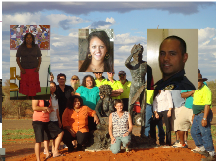
Shire of Wiluna Staff 2009