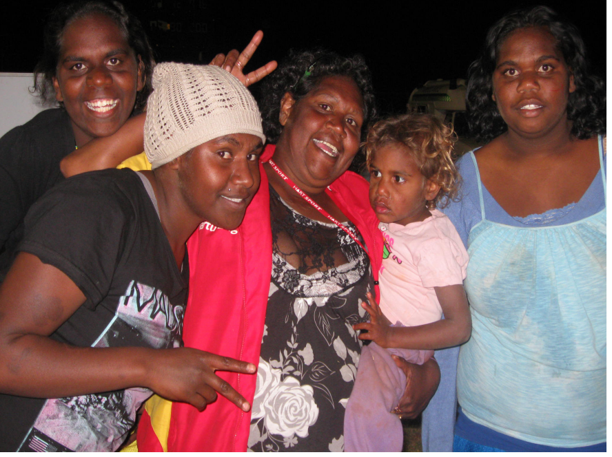
Top: Celebrating - the 2011 Darlka Grand Final Winners - Windidda Saints Below: Darlka Football Carnival – Best Supporting Team!

Final Score - Windidda Saints 10.2 (62) - Jackman Blues 6.10 (46).